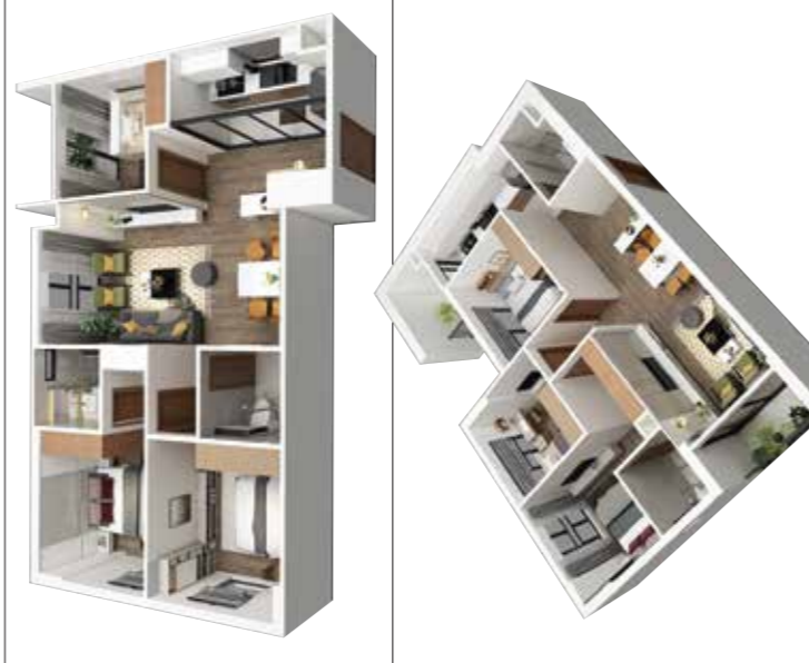
Floor 7 - 10 & 16 - 20 Floor 11 - 15 & 21 - 26 Floor 7 - 10 & 16 - 20