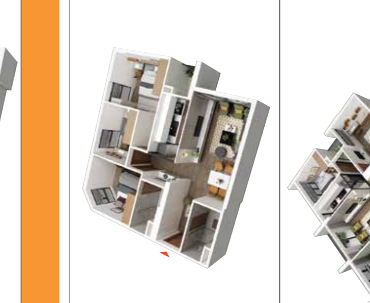
Floor 7 - 10 & 16 - 20 Floor 11 - 15 & 21 - 26 Floor 7 - 10 & 16 - 20