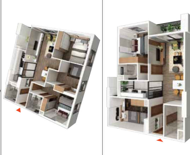
Floor 7 - 10 & 16 - 20 Floor 11 - 15 & 21 - 26 Floor 7 - 10 & 16 - 20