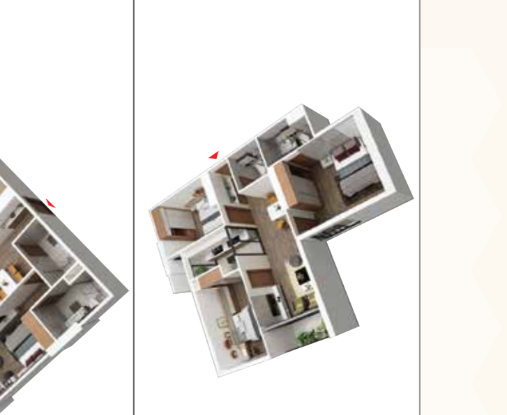
Floor 7 - 10 & 16 - 20 Floor 11 - 15 & 21 - 26 Floor 7 - 10 & 16 - 20