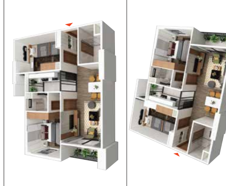
Floor 7 - 10 & 16 - 20 Floor 11 - 15 & 21 - 26 Floor 7 - 10 & 16 - 20