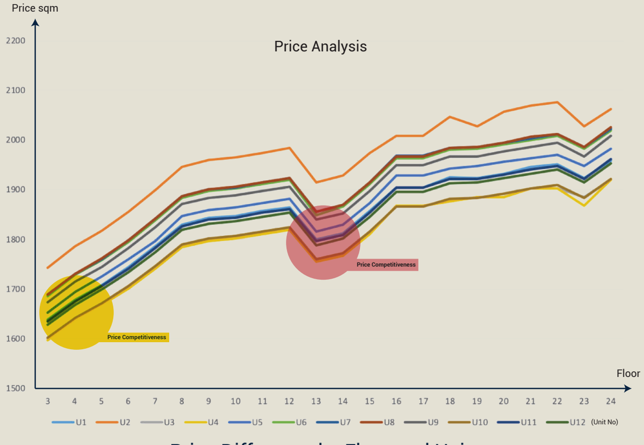
Price Difference by Floor and Unit