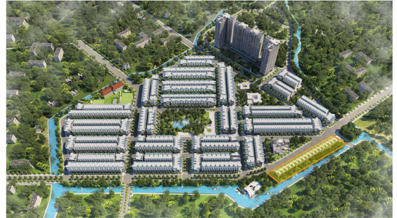
CĂN MẪU SEMI-DETACH MIDDLE 8m x 17m