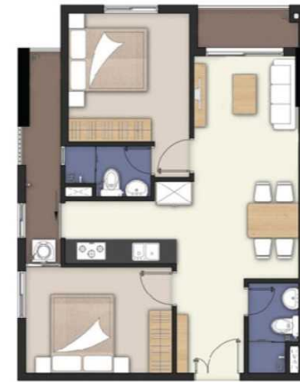
2 PHÒNG NGỦ 67,30m 2