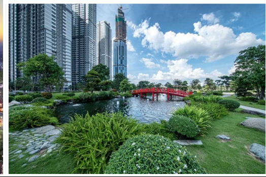
Vinhomes Central Park