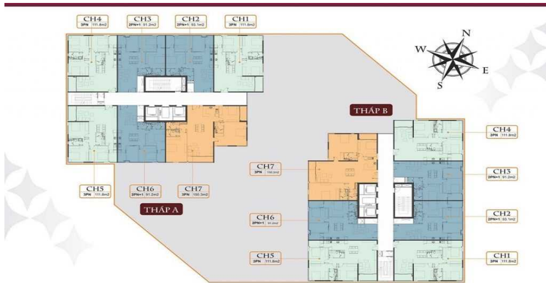
MẶT BẰNG ĐIỂN HÌNH TẦNG 11-28